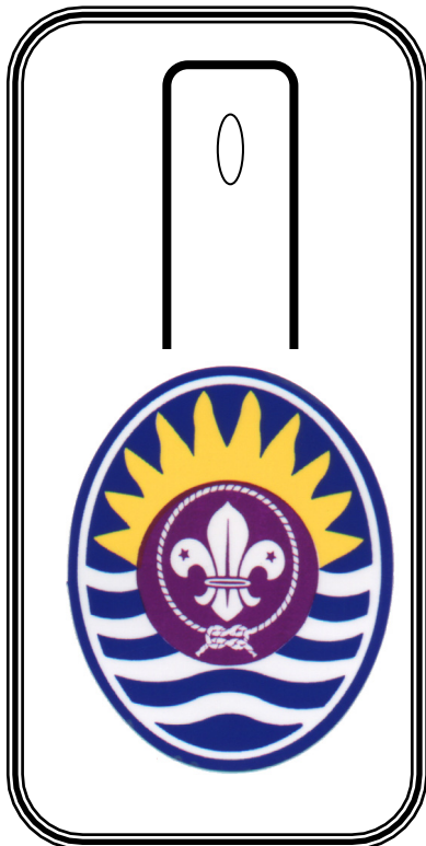
Professional Scout Executive Medallion